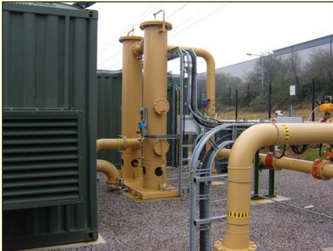
Duplex Arrangement - KR Series Coalescer Filters

Kelburn Engineering Limited provides a complete range of gas filtration and liquid separation equipment.