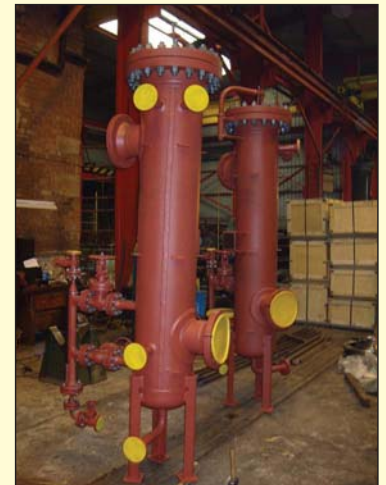
Gas Turbine Fuel Gas KS Series Coalescer Filter