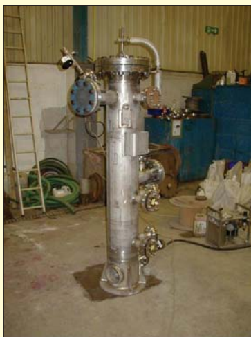
Gas Turbine Fuel Gas Coalescing Filter