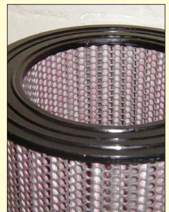
Coalescing Filter Element