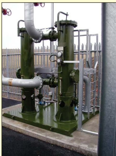
Duplex Arrangement - KR Series Coalescer Filters

Our large surface area pleated cartridge designs are used to increase gas throughput, provide compact vessel size, reduce gas velocity through the element to improve coalescence and avoid liquid re-entrainment, minimise pressure drops and to maximise the filter elements operational life span.